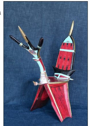
The Tamzak, a Touareg saddle

The Tuareg saddle belongs to the technological model that places the camel rider's weight on the withers, unlike the "pack saddle" or the four-pointed Arabian, Oriental, Egyptian, or Asian saddle, which distributes the weight between the withers and the flanks of the animal. The Tuareg saddle allows for a supple and refined ride because the camel rider can place his feet on the animal's neck and use this contact to stimulate or give commands to his mount. Every adult man makes it a point of honour to have his own Tamzak.