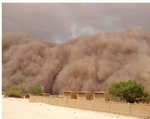
Tornado over the secondary school