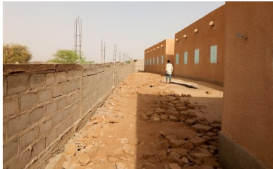
New perimeter wall under construction at the high school