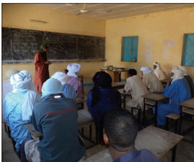
Meeting of Association of parent's pupils in primary school

In order to avoid any misunderstanding and bad connotation, we have taken up a new logo that clearly calls up to our world and our values: children, school, education.