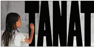
New Logo for the Association