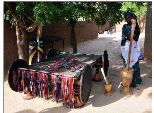
Bed, pestles: part of the trousseau given to the bride

will be a bed, pestles (millet / maize grinders), kitchen utensils, a few animals, etc.